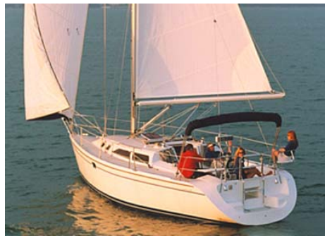
Kayaking and Sailing