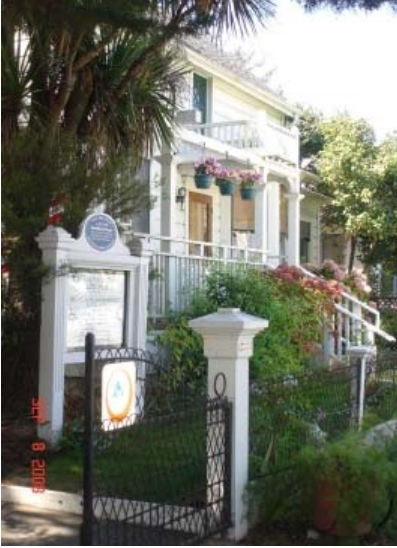
Santa Cruz Hostel