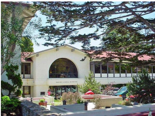
William Tell Coleman Library, Monterey Institute