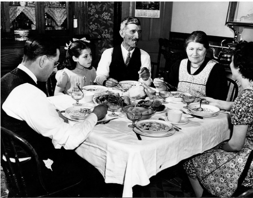
American family dinner!