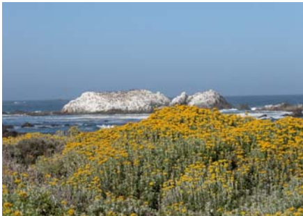
Bird Rock, Pebble Beach