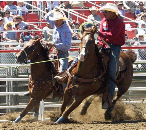
Salinas Rodeo, Monterey County