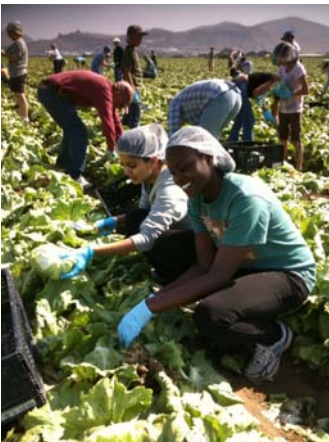
GTD students gleaning