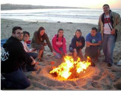
Bonfire on the beach