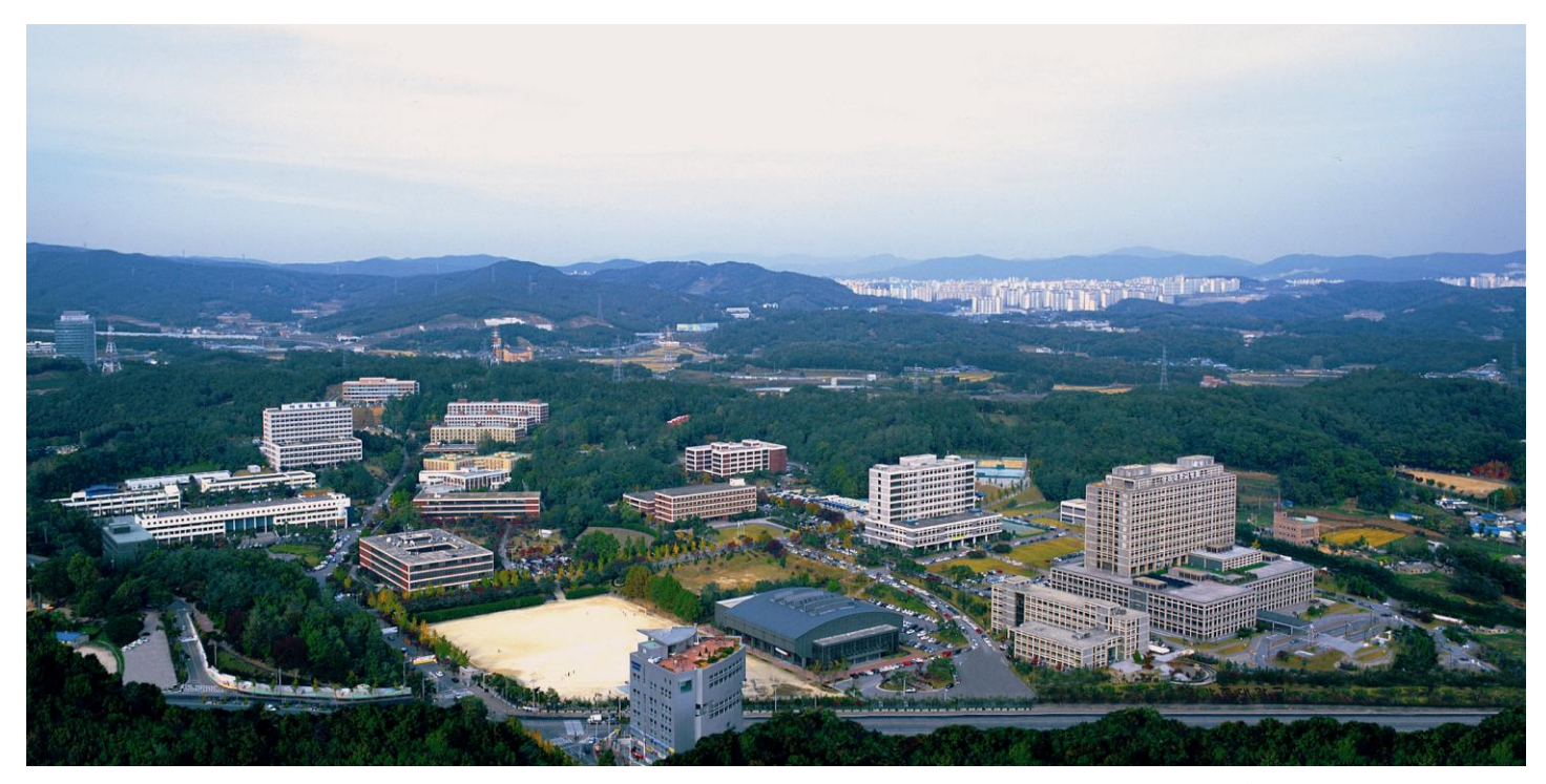
A bird's eye view of Ajou University