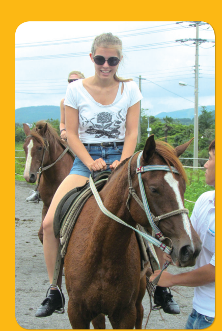
Jeju Island (UNESCO World Heritage)